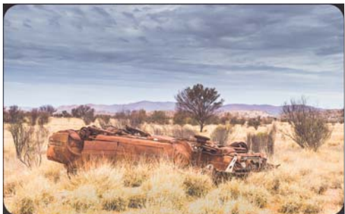
04 - if you walkabout don't forget water.jpg

You have handled the technical details of your photograph well. The building has shape because of your lighting and is very sharp. You have caught the flag at the right moment telling us the country of location. Colors are pleasing. Probably no way to shoot without cars and people but at least they are mostly in shadow. ***