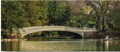
01 - Bow Bridge Central Park NYC.jpg