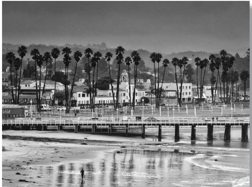
Santa Cruz Wharf and Waterfront.jpg Amy Sibiga