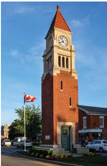
03 - Cenotaph NOTL.jpg

I like that you have started your photo from the lower right corner of your frame and let the shape of the island create your design. But this image suffers from a lack of separation from the water and lack of color. Nothing jumps out at you here. **