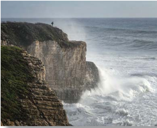
16 - The Cliffs of Davenport.jpg